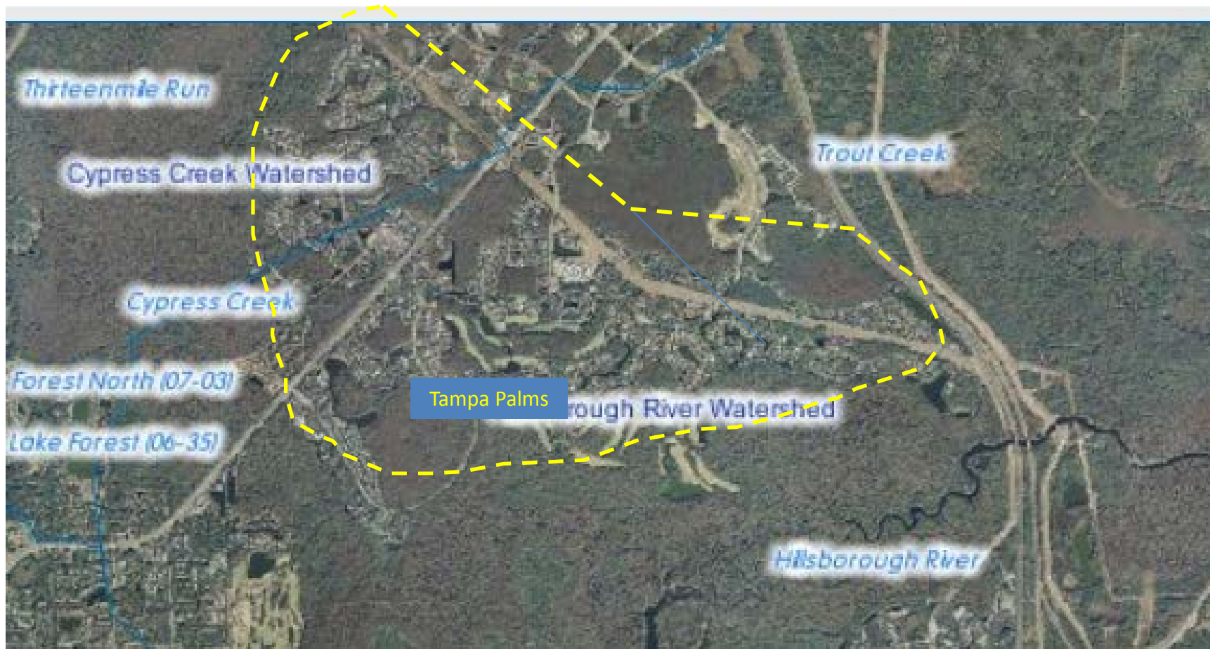
Drainage Basin Areas (Tampa Palms Outlined in Yellow) SWFWMD Map