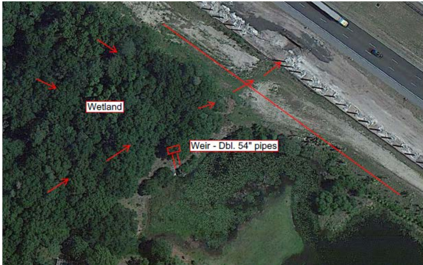
Prepared By FDOT August 2012 This Schematic Depicts Watershed Flow From TPOST 3 Under I 75 – In Direction of Trout Creek